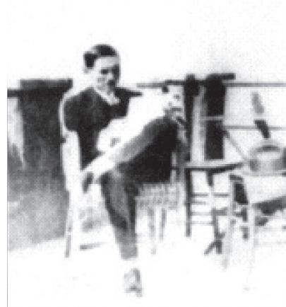
Hulusi Behçet in Nice in 1934