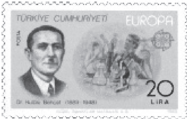
A Stamp About Hulusi Behçet